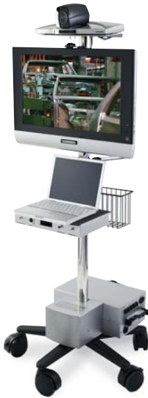
MOBILE UNIT WITH BATTERY PACK FOR VIDEO ON THE PRODUCTION FLOOR

“With development centers and designers in the U.S., Korea and Taiwan, R&D utilized video conferencing to shorten development cycles.”